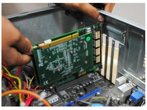
Figure 2: 2<sup>nd</sup> Gen of 8 ports PRI Card

2) Insert the Second Gen 4/8 port PRI (PCI/PCIe) card in the corresponding PCI/PCIe slot of the Server.